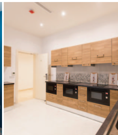
Easy School shared self-catering apartments.