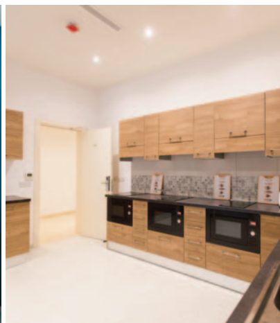
Easy School shared self-catering apartments.