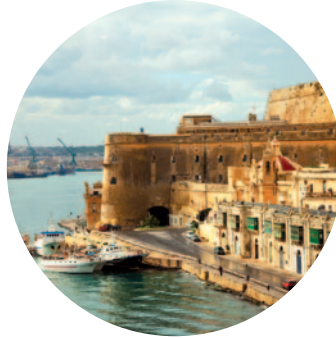
Valletta Grand Harbour