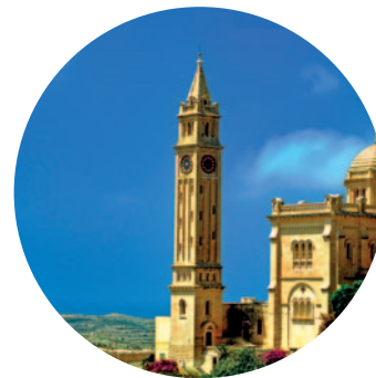
Ta' Pinnu Church